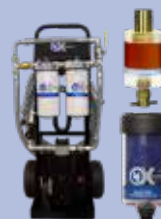
Contamination Exclusion & Removal