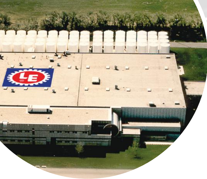
LE's state-of-the-art manufacturing facility, technology center, warehouse and primary office is located in Wichita, KS, with regional distribution out of Knoxville, TN, and Las Vegas, NV. Additional support functions are located in Fort Worth, TX. The company's international presence includes distributors in more than 60 countries.