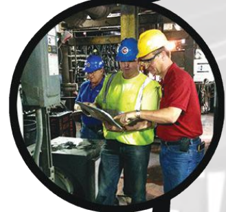
Xpert Equipment Reliability & Assessment